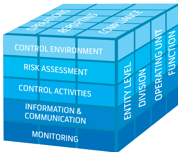
Figure 1: COSO Internal Control Framework

Grameenphone follows a risk-based approach for designing and implementing effective internal controls. Currently, the entire financial reporting of Grameenphone encompasses 19 inter-related processes. Risk assessment exercise is performed for each of the processes on annual basis. As part of the risk assessment, each process is evaluated through probability and impact matrix and categorised into a four-point ordinal scale (Very High, High, Medium and Low). Internal controls are designed and deployed to mitigate identified risks to an acceptable level.